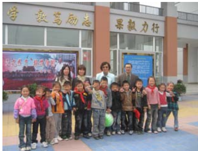
In front of the new school building 与汉旺镇中心校师生们在新校舍前合影