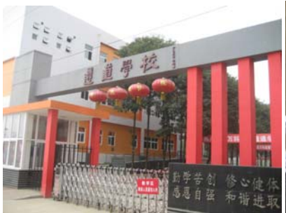
Another New school 由万科资助建立的遵道学校