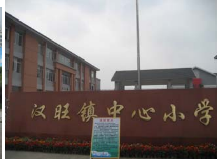
New Hanwan school 新建的汉旺镇中心校能容纳 1000 学生