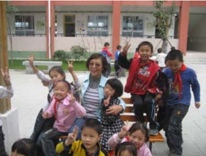
kids playing during the break 课间休息中的学生们