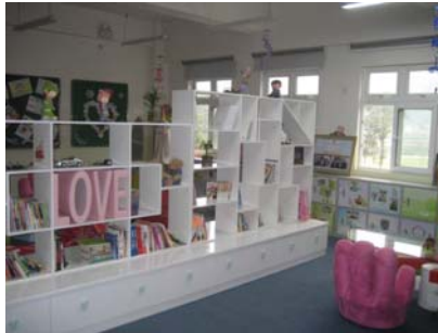
1+1 Heart to Heart Classroom 心联小屋中充满了爱