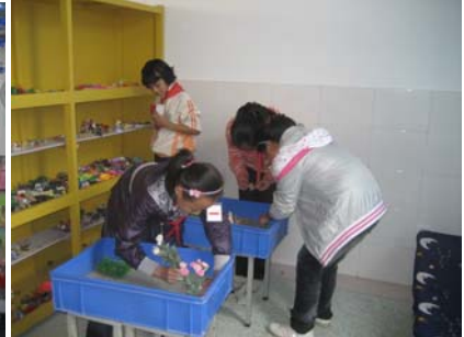
Playing games in 1+1 classroom 孩子们在心联小屋中作游戏