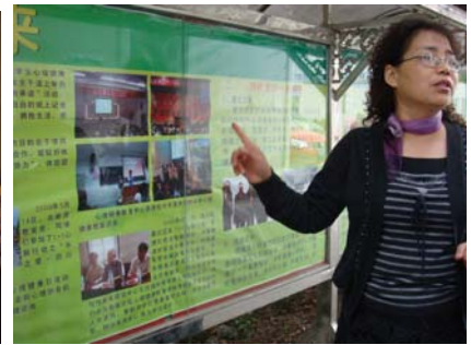
Successful stories of 1+1 activities 1+1 心联活动丰富多彩，成效显著