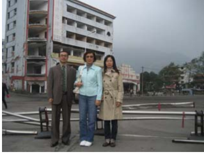
A damaged Building in Hanwan 绵竹市汉旺镇-5.12 地震重灾区