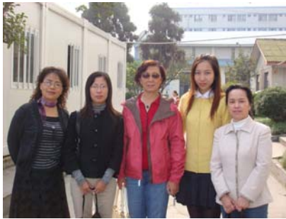
With 1+1 trained teachers 四川工商技术职业学校的老师