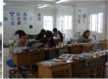
Students are in the temporary classroom 学生在临时板房教室中上课