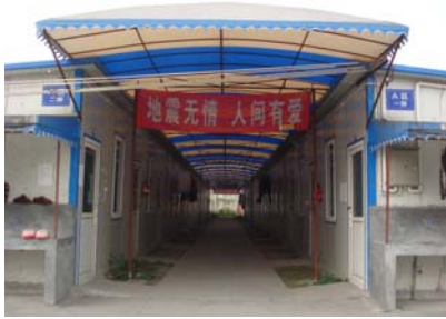
Students live in portable houses in the school 板房区的学生宿舍