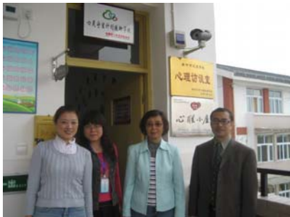
1+1 Heart to Heart Classroom 九龙学校的心理咨询室-心联小屋