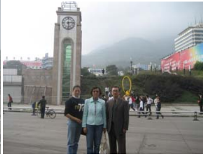
2:28pm, earthquake starts on 5.12 汉旺镇东汽广场时钟定格在 2 点 28 分