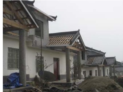
New houses will be completed soon 新建的民居快要完工了。