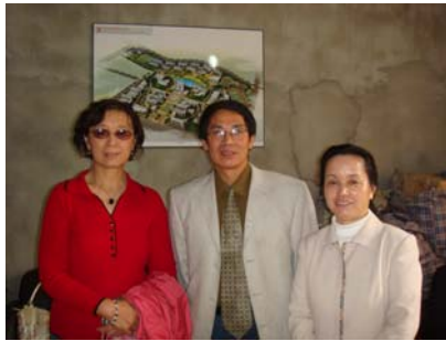
School blue print and principal 校长对明年搬入新校充满信心