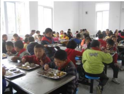
student at Lunch in new school 与学生们共进午餐