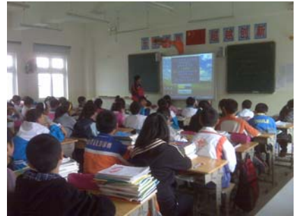
Study in the new Class room 学生们崭新的教室里上课